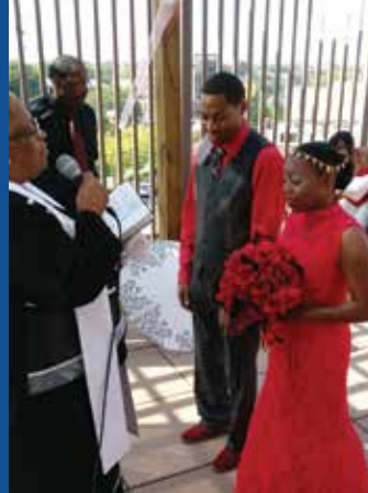
Love & Sharing