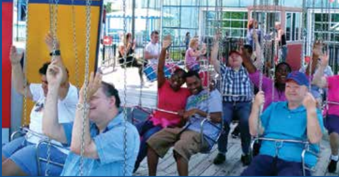
Fun & Adventures